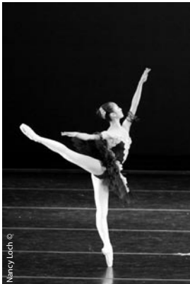
Nancy Loch ©