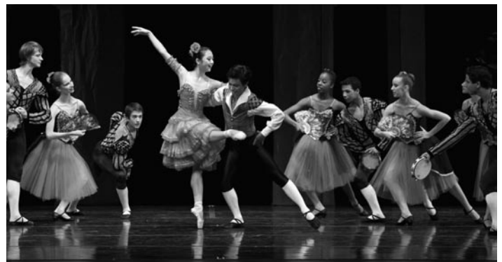
Dances from Don Quixote, Act I