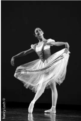
Nancy Loch ©