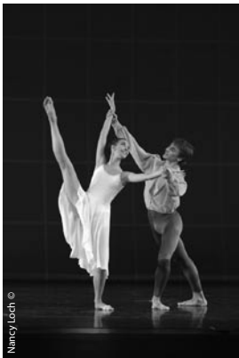
Nancy Loch ©